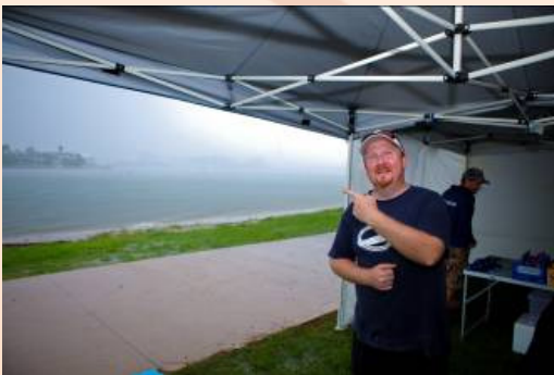
That 11am shower that snuck up on us