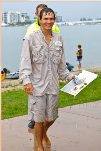
Forget the rain, it's easy to smile when you have 3 fish to measure!